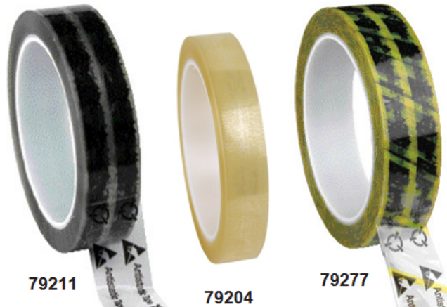
Tape is wound on a low-sloughing plastic core.

RoHS 2, REACH and Conflict Minerals Statement None of the RoHS 2 restricted materials or REACH substances of very high concern as of 2014/06/16; or conflict minerals are intentionally added in manufacturing this product. Ref: European Union Directive 2011/65/EU and Regulation (EC) No. 1907/2006/CE. See Desco Limited Warranty at Desco.com